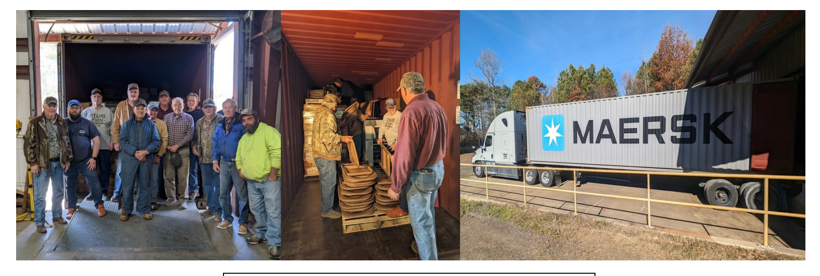
Loading a 40' HC container for ICP in the Philippines in December (below)

Disassembling pews with AR State Mission Builders and local volunteers for Bro. Livingstone Lambert's shipment in January (below)